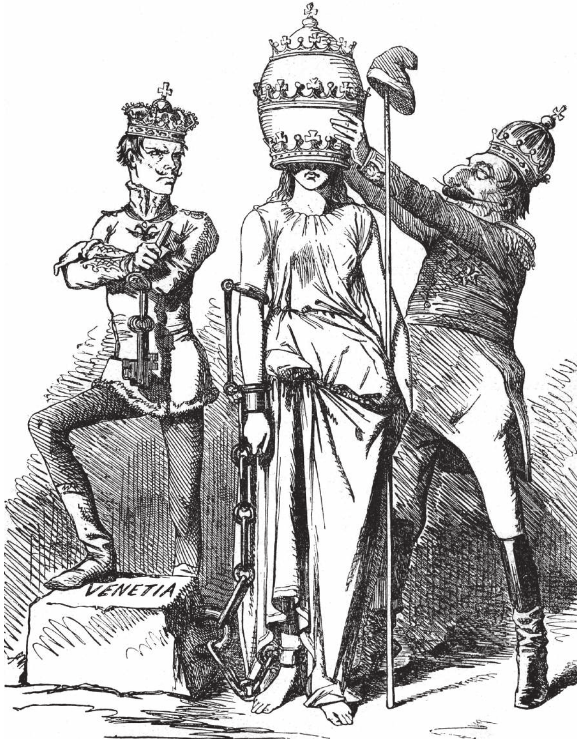
FREE ITALY (?)

A cartoon published in a British magazine in July 1859. The figures represent (left to right) Austria, Italy and Napoleon III. Italy is wearing the Papal crown.